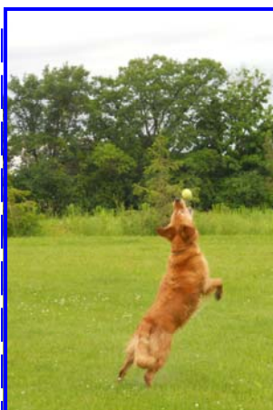
Chester having some fun

only the best of intentions. After all, we want to see them mature and grow into strong and healthy adults. However, we are now learning that overfeeding is by far, the wrong thing to do.